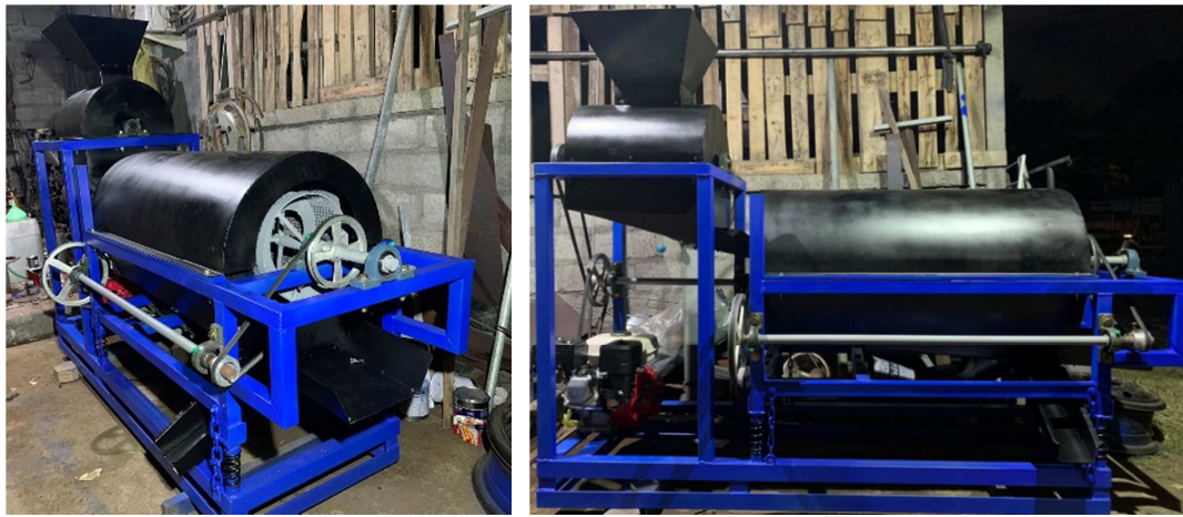
Figure 3. Clove Flower Threshing Machine Design.

From The design made, then realized in the form of a product in the form of a clove threshing machine, more details can be seen in figure 3.